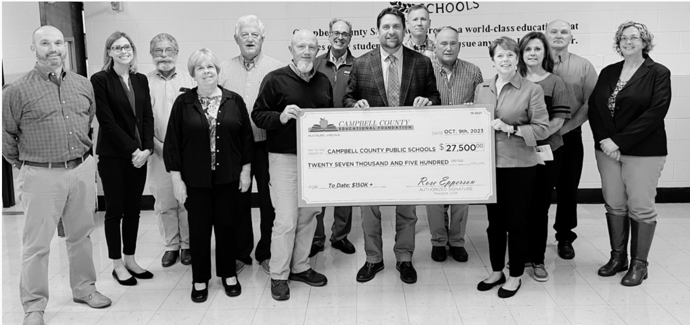
In early October, we presented a $27,000 check at the Campbell County Public School Board meeting, increasing our contributions to $150,000 since our inception in 2017.

MAKING EDUCATIONAL AND CAREER OPPORTUNITIES AVAILABLE TO CAMPBELL COUNTY STUDENTS AS THEY SEEK HANDS-ON, SKILLS-BASED TRAINING FOR HIGH-DEMAND JOBS IN OUR REGION