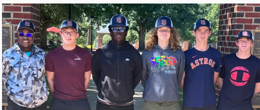
Clockwise from top left: Students visit Longwood College; Middle school students learn about work opportunities at BWXT; Students interact with representatives from Abbott; Students pose at the entrance of Hampden-Sydney College.