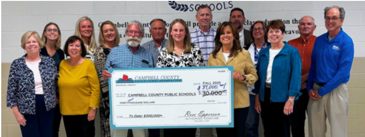
Campbell County Educational Foundation board members recently presented another $37,000 check to Campbell County School Board members bringing the foundation's total donations to Campbell County Schools to more than $300,000.

Dual-enrollment offerings include administration of justice, early childhood education, health sciences, emergency medicine, HVAC, information technology, machine technology, mechatronics and welding.